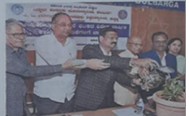
The annual activities of National Service Scheme being inaugurated at Siddhartha Law College in Kalaburagi, KARNATAKA