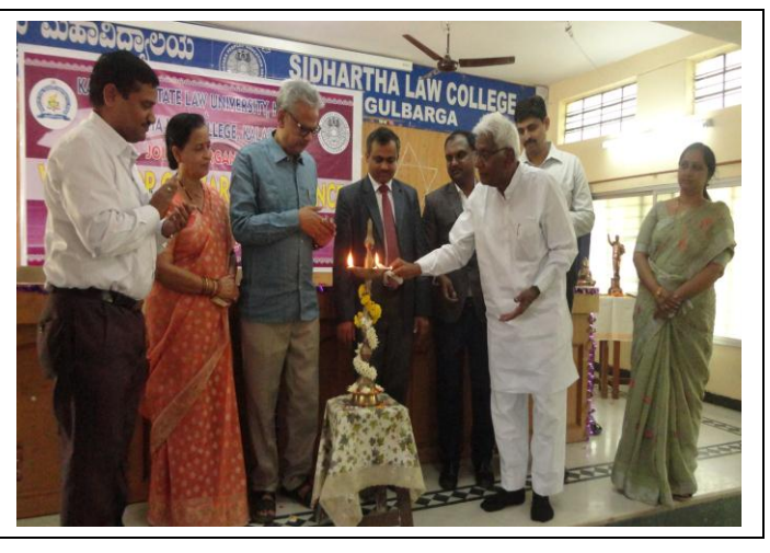
WORKSHOP ON COMMUNICATION SKILLS