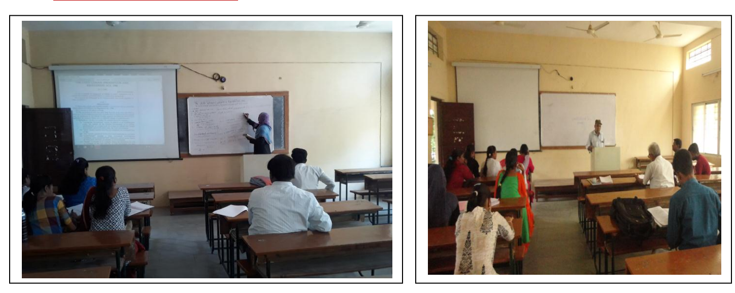
Interaction Programme with Central University Karnataka Kalaburagi